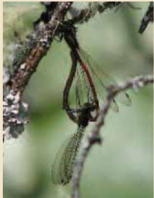
Large Red Damselflies Mating